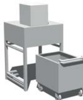
MF 26 + SIS300 (sold separately)