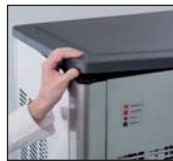
ABS plastic cover