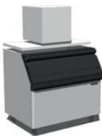
MF 26 + SB550 + KBT1 (sold separately)