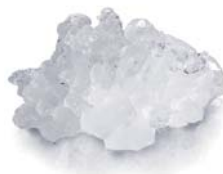
Residual water content 25%

Ice in its most natural form, made at a temperature just below zero degrees Celsius, contains 25% residual water content, making it very moist. Its flake shape makes it extremely versatile and very simple to use effectively.